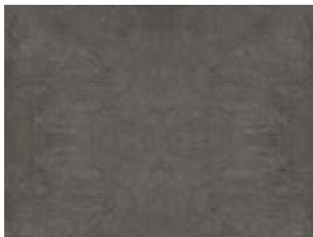
▲ Peat Sandstone