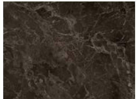
▲ Caldera Marble