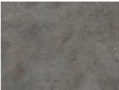
▲ Castle Concrete